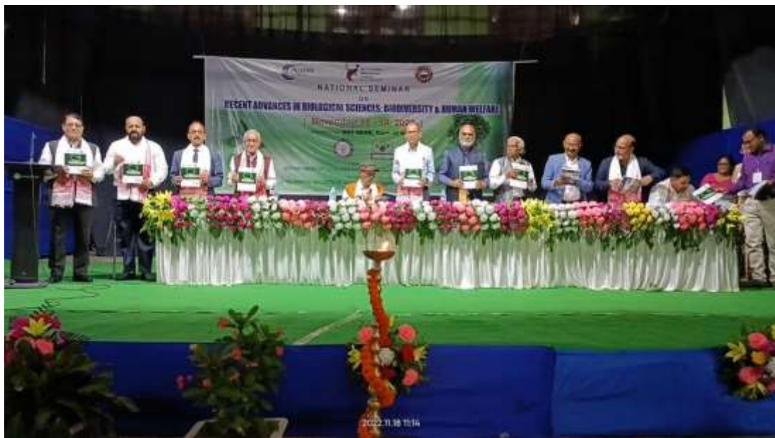
A two-day national seminar on ‘Recent Advances in Biological Sciences: Biodiversity and Human Welfare’ was held in Darrang College.