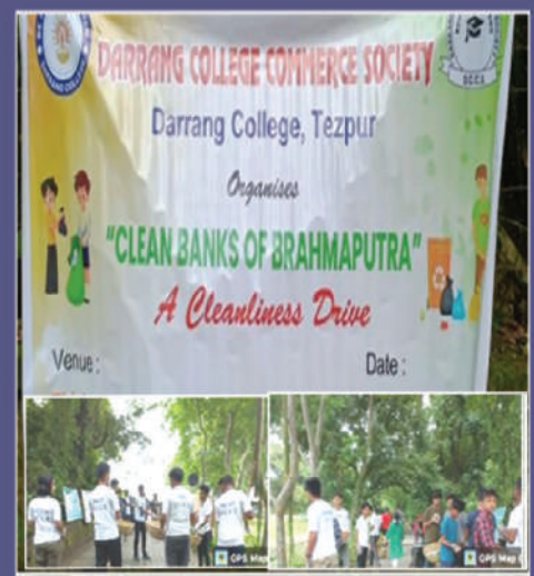
Darrang College Commerce Society (DCCS) organized 'Clean Banks of Brahmaputra: A Cleanliness Drive' on 25 September 2022.