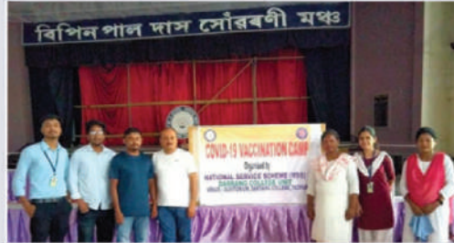
Covid -19 Vaccination camp(s) at Darrang College organized by NSS, Darrang College Unit, and Darrang College Medical unit on 18-07-2022 and 09-08-2022.