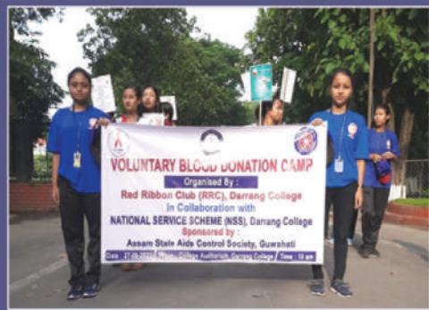
A voluntary Blood donation camp was held at Darrang College Auditorium on 27 September 2022, and in connection with the event, a rally was organized by RED RIBBON CLUB and NSS Unit, Darrang College on 24 September 2022.