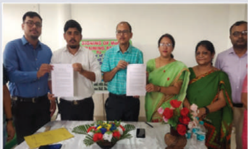
MoU between Darrang College and Directorate of Museums Indigenous and Tribal Faith and Culture Department, Govt. of Assam was signed on 19 August 2022, for a period of 3 years (2022-2025) with the agreement of scientific preservation of museum species, quality manpower development by imparting training to the students, teachers, and laboratory staff, an initiative of the P. G. Department of Zoology of the College.