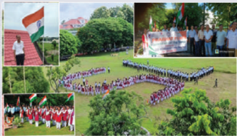
Celebration of Har Ghar Tiranga Program (11-15 August 2022) and 75th glorious years of Independence Day in the college.