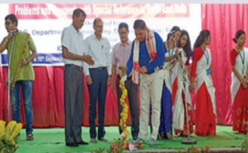
The ICSSR/ MHRD sponsored National Seminar organized by P. G. Department of Geography in collaboration with IQAC-Darrang College on 'Resources, Sustainability and Rural Development: Problem and Prospects with special reference to North-East India' during 9-10 September 2022.