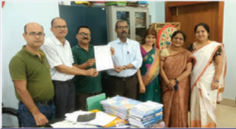
MoU between Darrang College and Tezpur Bengali Boys' H.S. School was signed on 18 July 2022, for a period of 5 years (2022-2027) with the agreement of academic cooperation, an initiative of the P. G. Department of Geography.