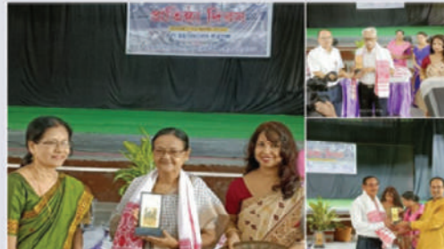
২৬ জুলাই ২০২২ তারিখে দৰং মহাবিদ্যালয়ৰ ৭৮ সংখ্যক প্ৰতিষ্ঠা দিবসত প্ৰাক্তন অধ্যক্ষ, মহাবিদ্যালয়ৰ পৰিচালনা সমিতিৰ সভাপতি, অৱসৰপ্ৰাপ্ত অধ্যাপক, অধ্যাপিকা আৰু অৱসৰপ্ৰাপ্ত কৰ্মচাৰীসকলক সম্বৰ্ধনা জনোৱা হয়।