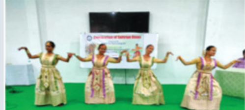
Tezpur, Assam, India JQ2X+83F, Mahabhairab, Tezpur, Assam 784001, India