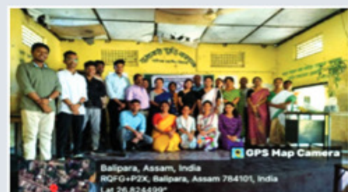
Balipara, Assam, India RQ2G+P2X, Balipara, Assam 784101, India

The Dept. of English conducted its 2nd visit to Chandmari Primary School on 23 November 2023 as part of the extension services. The students of the department had engaged in storytelling through the medium of music, graphics and painting.