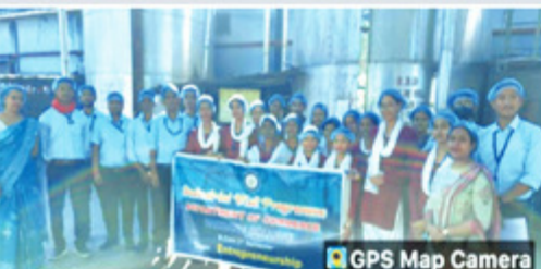
No.1 Dolabari, Assam, India MR6J+C7P, Panch-Mila, No.1 Dolabari, Tezpur, Assam 784027, India