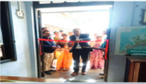
Principal of the College inaugurated the departmental museum of P.G. Dept. of Geography on 22 December 2023.