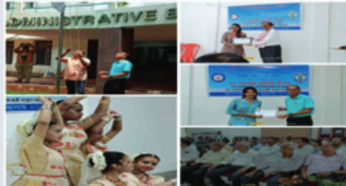
Darrang College celebrated its' 78th Foundation Day on 26 July 2023, and in this Foundation day various Academic Awards were distributed.