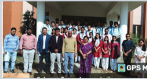
A Collaborative Outreach Program with Indian Statistical Institute (ISI) jointly organized by the Dept. of Statistics, Darrang College and ISI (NE), Tezpur on 6 December 2023.