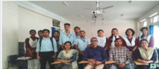
Tezpur, Assam, India JQ2X+83F, Mahabhairab, Tezpur, Assam 784001, India

An Outreach Program at Darpan (an Old-age Home), Besseria was organized by the Dept. of Geography on 14 November 2023.