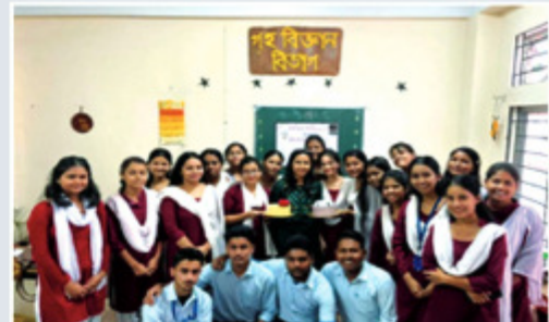
A workshop on "Bakery Products" was organized by Art & Craft Centre (Dept. of Community Science) in collaboration with the college's IQAC on 8 November 2023.