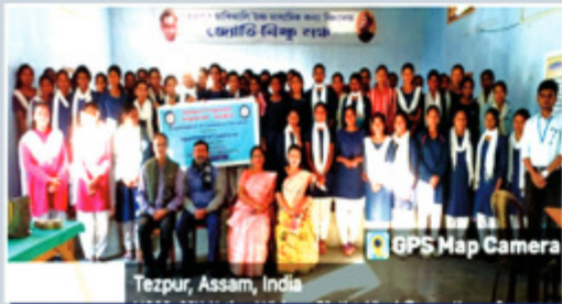
On 30 November 2023, faculties of the Dept. of Commerce organized an outreach program on 'Popularization of Commerce Education' at Tezpur Chariali Girl's High School.