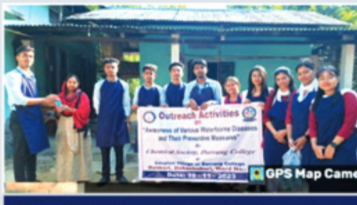
An Outreach Activities on Waterborne Diseases was organized on 10 November 2023 by the Society for Chemical Society, Dept. of Chemistry, Darrang College.