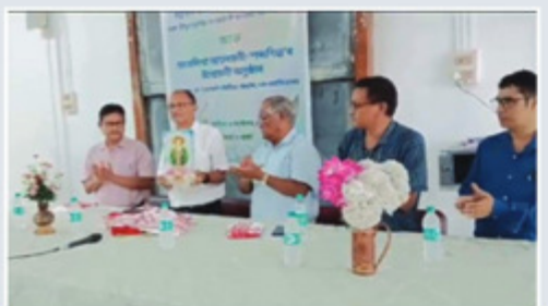
৪ অক্টোবৰ ২০২৩: অসমীয়া বিভাগৰ হাতে-লিখা আলোচনী 'শব্দ শিল্প' ৰ উন্মোচন।