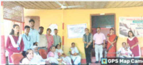
Tezpur, Assam, India MP2W+P5P, Besseria, Tezpur, Assam 784150, India

An Outreach Program at Darpan (an Old-age Home), Besseria was organized by the Dept. of Geography on 14 November 2023.