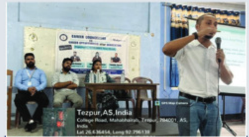
Career Counseling Program on Career Opportunity after Graduation is organized by Darrang College Commerce Society in collaboration with MAHENDRA'S Tezpur Branch on 21 September 2023.