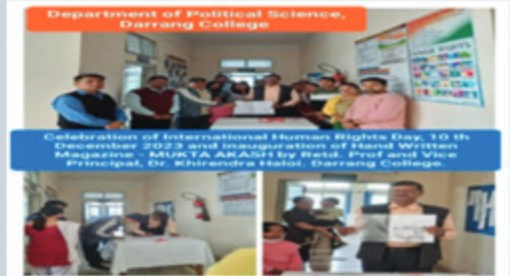
International Human Rights Day 2023 was observed on 10 December by the Department of Political Science, Darrang College, Tezpur.