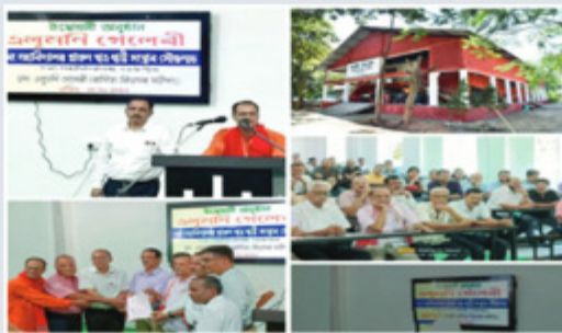
30 September 2023: Inauguration of Alumni Gallery constructed by Darrang College Alumni Association.