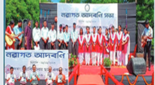
29 September 2023: Freshmen Social Program – 2023, and Inauguration of 5th Edition of Darrang College Chronicle - A News Letter of the College.