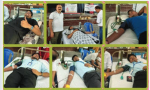
On 2 October 2023, DCCS in collaboration with NSS unit organized a Blood Donation Camp. NSS volunteers, DCCS executives and few faculty members of the college came forward for this noble cause. The collected 49 units of blood were deposited in the blood bank of Kanaklata Civil Hospital, Tezpur.