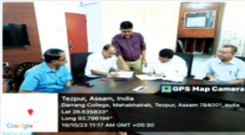
19 October 2023: Historic Signing of Agreement for legally Handover "Alumni Gallery Classroom" to Darrang College Authority.