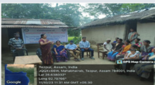
11 October 2023: Celebration of "International Day of the Girl Child", organized by IQAC-Darrang College at Bahbari, Dekachuburi, an Adopted Village of the College.