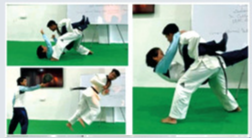
A Week long (3-9 November 2023) Self Defense Training for Girls Students of the College was organized by the Darrang College Women Forum in association with IQAC and DCSU, Darrang College.