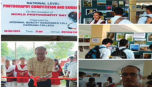
On 19 August 2023 National Level Photography Competition and Exhibition on the occasion of World Photography Day 2023 was organized by IQAC, Darrang College.