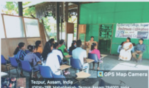
From 6 November 2023, a Week long Training program on Mushroom Cultivation for the villagers of Bahbari, Dekachuburi was started at Darrang College Mushroom Cultivation and Training Centre.