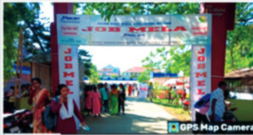
A Job Mela organized by Assam Rural Livelihood Mission held at Darrang College campus on 31 October 2023. 32 Groups have come to offer jobs.