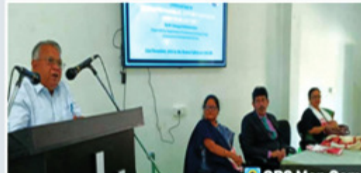
Tezpur, Assam, India

Industrial Visit Program at Mother Industries Pvt. Ltd. Tin mile, Tezpur was organized by the Dept. of Commerce for Entrepreneurship Development on 18 Nov. 2023.