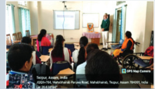
On 22 December 2023, the Dept. of Mathematics celebrated 'National Mathematics Day' on the occasion of 136th Birth Anniversary of Srinivas Ramanujan.