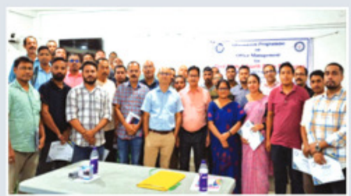
Successfully completed 5 days Orientation Program organized by IQAC-Darrang College for Non-teaching staff of the College on 16 October 2023.