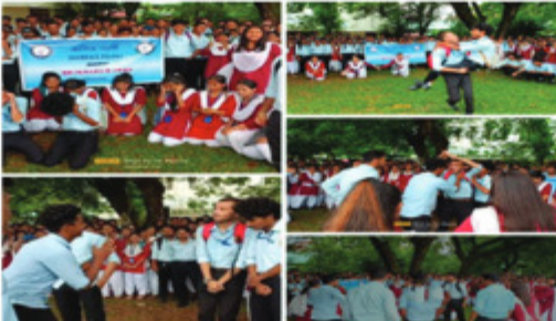
24 August 2023: 'Street Play' for Anti-Ragging Campaign at Darrang College, Tezpur.