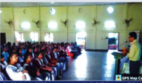
On 30 August 2023 a program on Alcohol, Tobacco or Other Drugs Screening and Intervention for the Boards of Darrang College Boys' and Girls' hostel was organized by the Department of De-Addiction Medicine, LGBRIMH, Tezpur in collaboration with Counseling Center Darrang College.