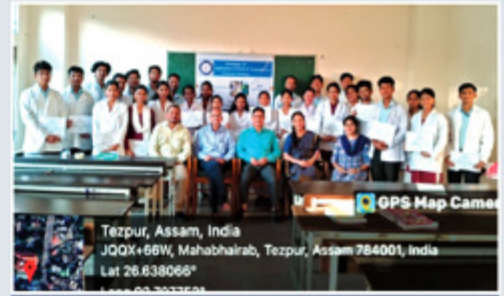
Dept. of Biotechnology and IQAC, Darrang College organized a workshop on 'Application of Tools & Techniques in Molecular Biology' from 6-10 November 2023.