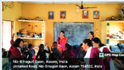
Niz-Bihaguri Gaon, Assam, India Unnamed Road, Niz-Bihaguri Gaon, Assam 784502, India

Both PG and UG students of the Dept. of Botany visited 'Toklai Tea Research Institute' and 'Hollongapar Gibbon Sanctuary' on 17 November 2023 as a part of their educational visit to Botanical Institute/Place.