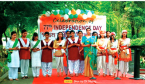
15 August 2023: Celebration of 77th Independence Day 2023 by Darrang College, Tezpur.