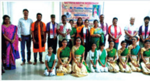
17 July 2023: Closing Ceremony of Sattriya Nritya Workshop organized by Nrityashala in collaboration with IQAC Darrang College, Tezpur.