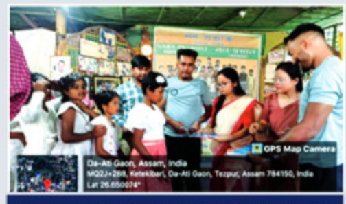
An Outreach Program on the occasion of Children Day and Child Rights at Nabaprabhat Orphanage Home, Ketekibari was organized on 14 November 2023 by the Dept. of Education, Darrang College.