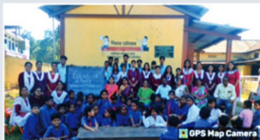
Chandmari, Assam, India

A Field Training Program on the Collection of Honey Bee was organized by the P.G. Dept. of Zoology on 21 November 2023 in association with Krishna Vigyan Kendra, Napanam for UG and PG Students of the College.