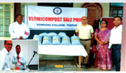
Vermicompost Production and Sale Point of the College inaugurated on 7 September 2023.