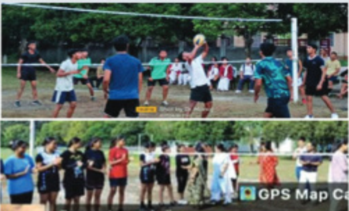
29 September 2023: Friendly Volleyball Match among Darrang College Boy/Girl students on the occasion of National Sports Day 2023 at Darrang College, Tezpur.