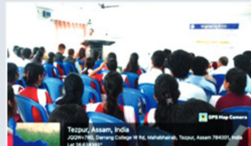
Tezpur, Assam, India JQ2W+786, Darrang College W Rd, Mahabhairab, Tezpur, Assam 784001, India

On 17 November 2023, Dept. of Mathematics and Mathematics Study Circle jointly organized an Out-Reach Program 'Tools and Tricks of Mathematics' for the students of Baahbari L.P. School, Tezpur.