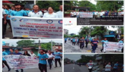
29 August 2023: Celebration of National Sports Day 2023, Community Run: "Run for the planet".