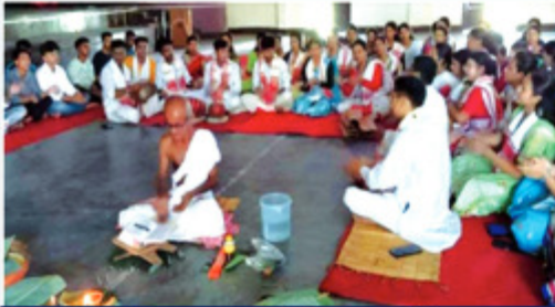
১৬ চেপ্টেম্বৰ ২০২৩: হৰি নামত মুখৰিত দৰং মহাবিদ্যালয়ৰ প্ৰেক্ষাগৃহ। অসমীয়া বিভাগৰ ছাত্ৰ ছাত্ৰী সকলৰ উদ্যোগত মহাপুৰুষ শ্ৰীমন্ত শংকৰদেৱৰ তিৰোভাৱ তিথি পালন।